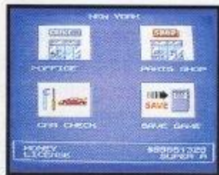
Driver's Status Bar

There are four windows in each city, The Registration Office, The Car Check Station, Save Game and a special feature window. This window may be a PARTS SHOP where you can buy parts, a SPEED SHOP where you can sell parts, a CAR SHOP where you can purchase a new car or THE SETA CASINO where you can, well, take a guess.